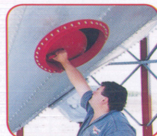
22" dia. manway is standard.