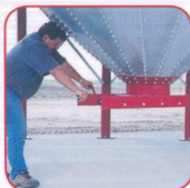
Rack & pinion gate.

Bridgeview's galvanized, bolted hopper bottom cones are manufactured in 12', 14', 15', 18', 21', 24' and 27' diameters. They are engineered for capacities from 1,400 bu. to 20,000 bu. Remember, the bigger the bin the lower the cost per bushel. Plus, you'll save on set-up time during harvest. Also, when the time is right for a handling system you'll save more money by having fewer bins to tie into the system.