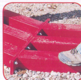
Steel foundations available.